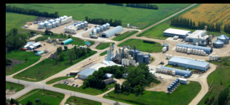
St. Joseph, MB